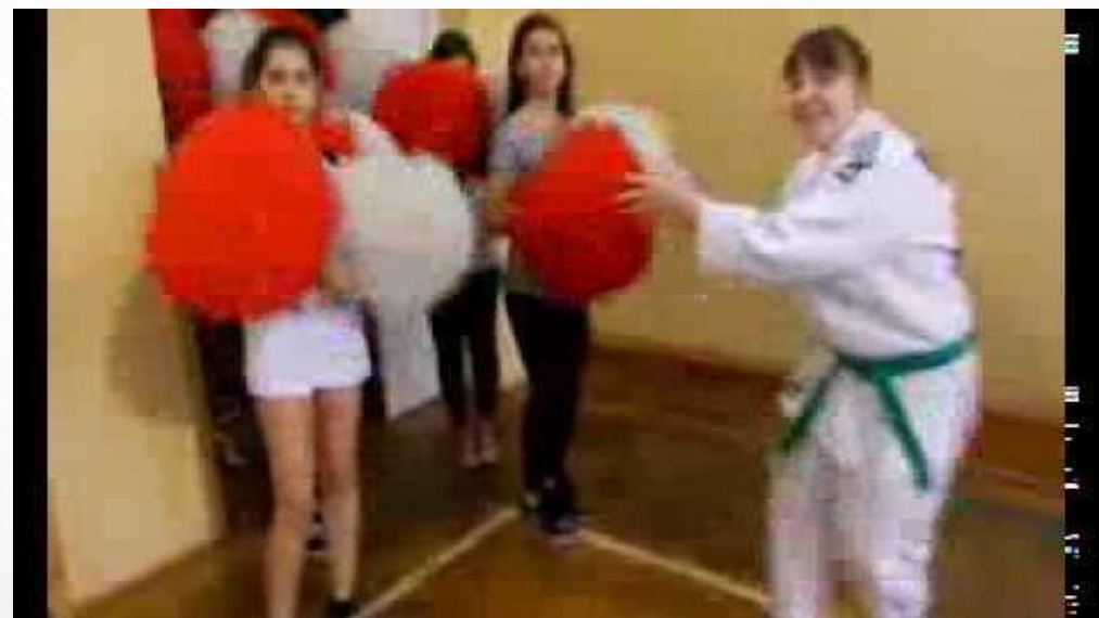
STUDENTS LIP DUB REHEARSAL